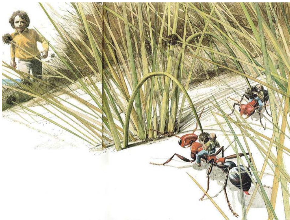
Figure 2. Vindictive marram-grass gnomes riding the bulldog ant and catapulting a frond full of sand into the faces of pop-top littering people departing from a leisurely day-at-the-beach. Reproduced with permission from Robert Ingpen.

by those resident marram gnomes, for the crime of littering the sands and dunes during the day.